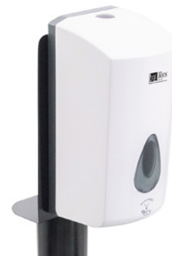
HANDS-FREE SANITIZER DISPENSER PB-SD-2 (SOLD SEPARATELY)

SOME UNITS SHIP UNASSEMBLED FOR REDUCED SHIPPING COST. ALL DIMENSIONS ARE TYPICAL. TOLERANCE +/- .500"