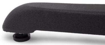
ADJUSTABLE FLOOR GLIDES