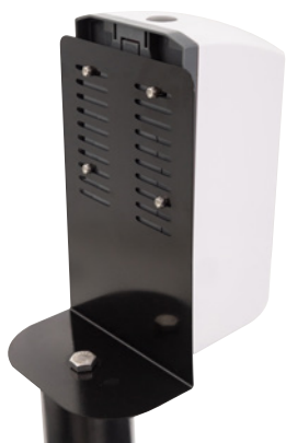
BACK MOUNTING PLATE