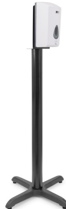
SHOWN WITH HANDS-FREE DISPENSER ATTACHED